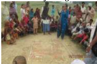
Photo2: Sanitation mapping