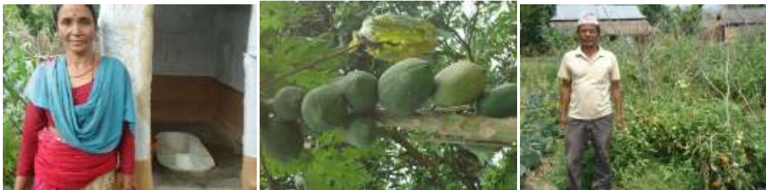
Photo 4 : Eco toilet of Rupa Sunar Photo 5: Papaya using urine Photo 6: Vegetable farming