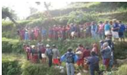
Photo1: Triggering to stop OD