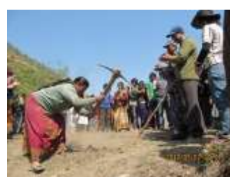
Photo3: Started to cover over shit