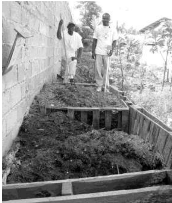
Figure 10: Two men manage the compost sanitation system at the Amurt School. The nearer bin has reached maturity and is being used in the gardens. The far bin has been aging for 6 months and is still over approximately 55C. It will require months more to reach maturity and cool down.

The self-managed compost system has a dedicated crew of three persons: one woman who cleans the compost receptacles and two men who manage the composting (Figure 10). They are paid by the school.