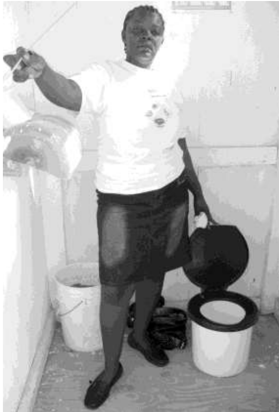
Figure 5: This lady keeps the toilets clean at the Amurt School.