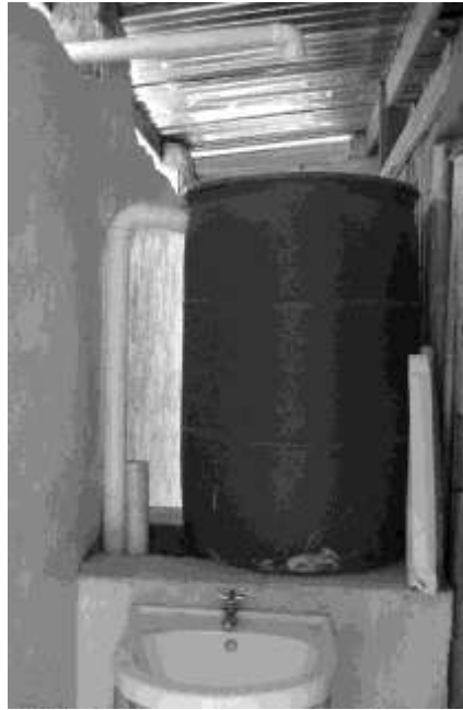
Figure 26: Sopudep's toilet includes a hand washing station provided by rain water.