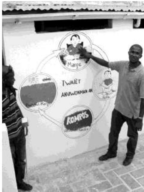
Figure 24: The compost sanitation system at the Sopudep School in Port au Prince utilizes the same procedures as Amurt and Matt Gunn. The “human nutrient cycle” from the Humanure Handbook is painted on the toilet wall, translated into Creole.

Sopudep School set up a similar compost sanitation system utilizing 20 liter receptacles with the help of GiveLove.org. It is also self-managed by school personnel trained by GiveLove. Their toilets serve 500 children at a time when school is in session. The toilet stall also has a painting of the human nutrient cycle on the outer wall for educational purposes (Figure 24). The compost bins are immediately adjacent to the toilet stall and the bagasse supply is also nearby. The bagasse is stored next to the toilets in wall-mounted dispensers (Figure 25). Rain water is collected and provided for hand washing (Figure 26).