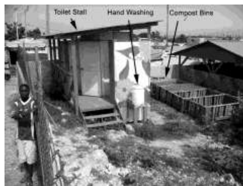
Figure 4: A toilet stall at the Amurt school, located next to the compost bins.

Amurt, a “green” school, consists of 11 pavilions and 22 classrooms, 8 composting toilets, 8 rainwater catchment systems, a reservoir, a composting site, a tree nursery, a permaculture demonstration site and organic garden. Two Agronomists and three technicians provide classes and demonstrations of urban permaculture, with a particular focus on the 820 children attending the preschool and after school programs, their parents, and the women’s and youth groups. Here, students utilize two toilet stalls, each with four toilets (Figure 4).