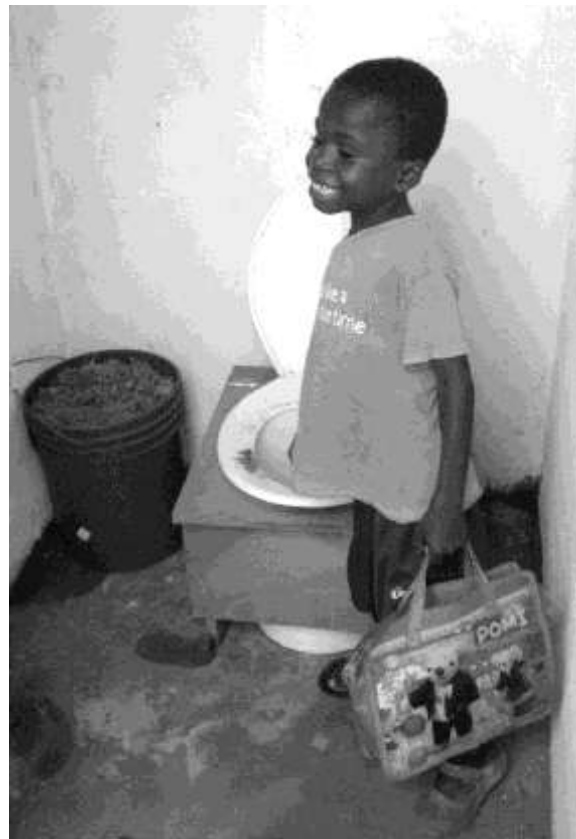
Figure 23: Twenty liter receptacles provide smaller toilets for young children. The dark bucket to the left is full of bagasse cover material. After using the toilet, the children cover the contents with the bagasse. This compost sanitation system is self-managed by orphanage personnel.