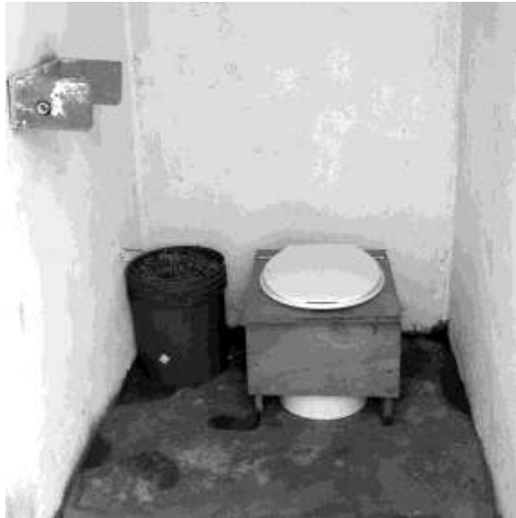
Figure 2: Toilet contents are covered inside this receptacle with sawdust and/or bagasse. The 20-liter receptacle simply lifts out when full.

Figure 3 shows another humanure toilet with the toilet receptacle completely exposed and ready for removal.