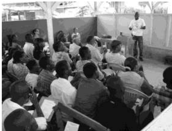
Figure 17: Community training seminars that teach local residents about this type of sanitation system are provided by GiveLove.org.