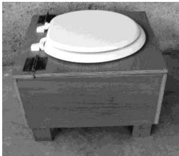
Figure 1: Typical 20 liter capacity humanure toilet in Haiti.

Figure 1 illustrates a 20-liter capacity humanure toilet in Haiti. Under the toilet seat is the toilet receptacle where urine and feces are collected and covered with amyris sawdust, sugar cane bagasse, or another locally available plant cellulose material. The cover material, when the texture and moisture content are correct and when it is used in adequate quantities, completely blocks odors and flies. When full, the toilet receptacle is removed from the toilet and set aside with a lid, to be collected and composted at a separate location.