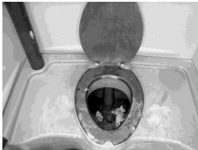
Figure 19: A portable toilet in Cite Soliel next to a medical clinic fills up and remains unattended. It is so unpleasant that the local children defecate openly on the ground around the toilets rather than go inside.