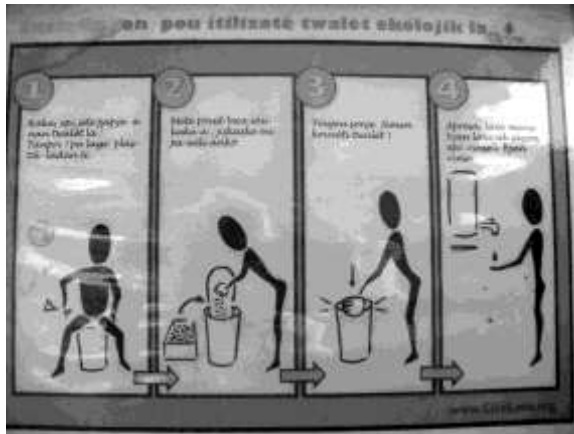
Figure 16: Posters describing the correct way to use the toilets are posted in every toilet stall.