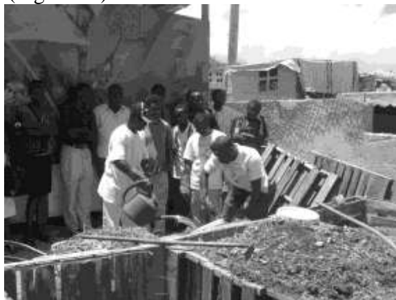
Figure 12: The toilet receptacles are rinsed after emptying.

The toilet receptacle is rinsed with water (Figure 12) and the water is dumped into the compost pile (Figure 13). The cover material is then raked back over the fresh deposit and new cover material is added (Figure 14).