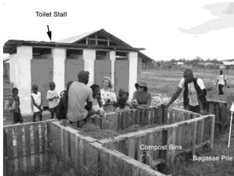
Figure 20: The toilets at the Matt Gunn orphanage site are located adjacent to the compost bins. There is no odor and no flies. A bagasse pile nearby provides the cover materials.