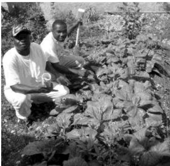
Figure 15: Mature compost is an excellent soil additive for gardens.

The compost must undergo a prolonged aging period of approximately a year after it is collected. Otherwise, the compost will be immature and phytotoxic (it will kill plants). Maturity is reached when the compost pile cools down and the internal temperature is approximately the same as ambient temperatures. At this point, the compost is suitable for growing food. There is no waste in this system. Instead, where other sanitation systems produce sewage and pollution, compost sanitation produces fertile soil and food for humanity (Figure 15).