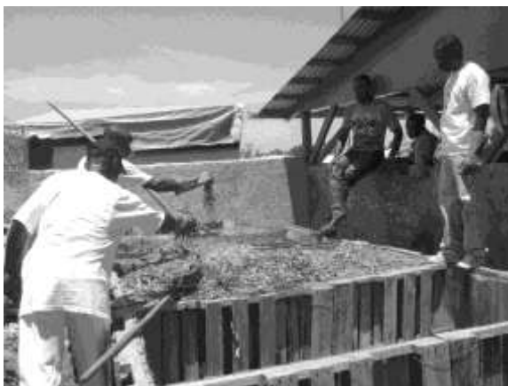
Figure 14: The fresh material is covered over and buried under bagasse.

The compost must undergo a prolonged aging period of approximately a year after it is collected. Otherwise, the compost will be immature and phytotoxic (it will kill plants). Maturity is reached when the compost pile cools down and the internal temperature is approximately the same as ambient temperatures. At this point, the compost is suitable for growing food. There is no waste in this system. Instead, where other sanitation systems produce sewage and pollution, compost sanitation produces fertile soil and food for humanity (Figure 15).