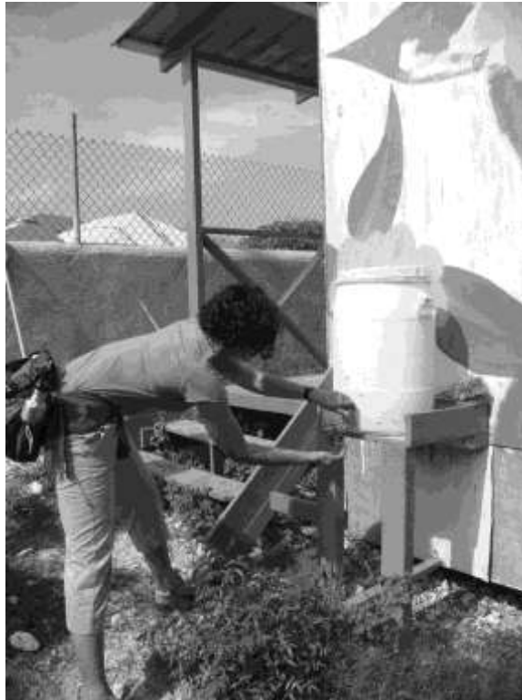
Figure 9: Hand washing stations are an important part of compost sanitation systems.

The self-managed compost system has a dedicated crew of three persons: one woman who cleans the compost receptacles and two men who manage the composting (Figure 10). They are paid by the school.