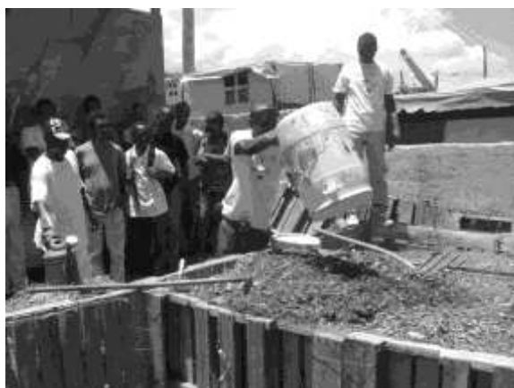
Figure 13: The rinse water is dumped into the compost pile.