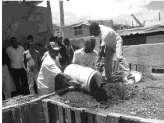
Figure 11: The compost pile is opened and fresh toilet material is added into the pile.

When toilet receptacles are full, they are deposited into the compost bin. First, the cover material is raked back, and then a depression is dug into the top of the compost pile. The toilet material is added into the depression (Figure 11).