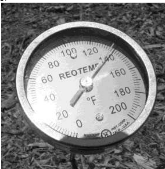
Figure 8: Temperatures recorded in Haiti's humanure compost piles ranged from approximately 46C to over 70C. This is approximately 60C. Fluctuations vary according to size of pile, age and contents.

Food scraps are added to the compost bin twice a day. Temperatures in the nearly full active compost bin were measuring approximately 60C (Figure 8). A bin that had been aging for six months was still reading 55C.