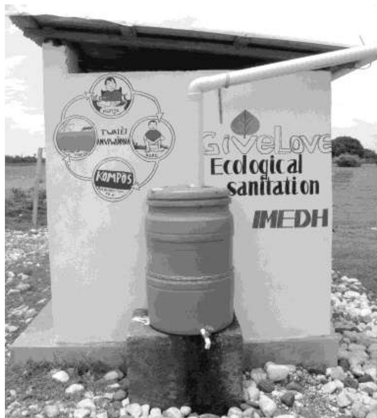
Figure 21: The Matt Gunn site toilet stall is painted with a picture of the “human nutrient cycle” as well as a “GiveLove ecological sanitation” emblem. GiveLove.org provided the setup and training for this self-managed compost sanitation system at the orphanage.