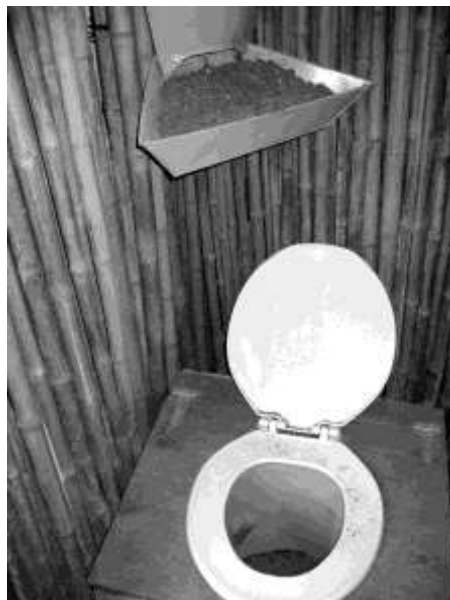
Figure 25: Sopudep uses 20 liter receptacles that lift out of the toilet when full. The bagasse is dispensed from a wall-mounted bin.