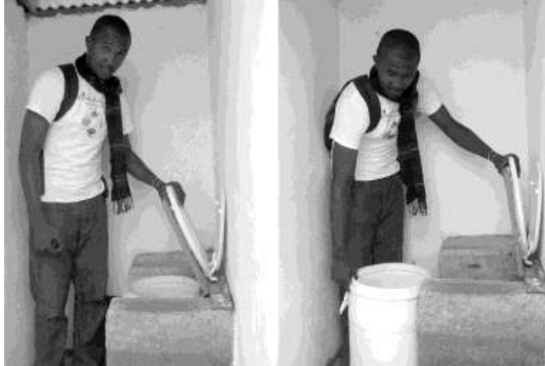
Figure 22: The Matt Gunn toilets utilize both 20 liter and 60 liter toilet receptacles. This photo shows a 60 liter toilet. The receptacle simply slides out the front of the toilet when full, and then a lid is placed on the toilet until it is emptied.