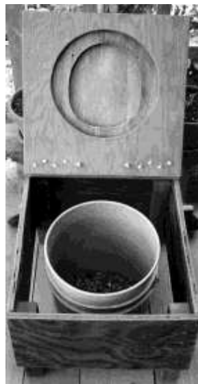
Figure 3: The toilet receptacle is easily removable.

Figure 3 shows another humanure toilet with the toilet receptacle completely exposed and ready for removal.