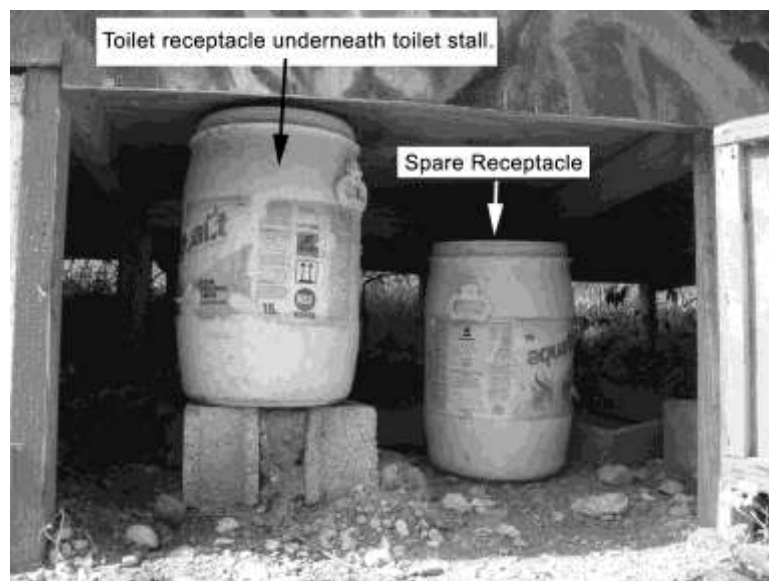
Figure 6: 60 liter receptacles slide out from underneath the toilet stalls.

They can easily be replaced with empty receptacles when full. Sugar cane bagasse and amyris wood sawdust are utilized as cover materials. The system produces approximately eight 60-liter containers of toilet material every three days. This volume fills a compost bin measuring 1.5 meters wide, two meters long and one meter high, every three months (Figure 7).